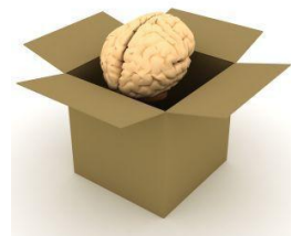
Think Outside the Box!